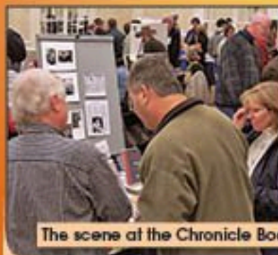
The scene at the Chronicle Book Fair

on Maple & Ridge Streets in downtown Glens Falls